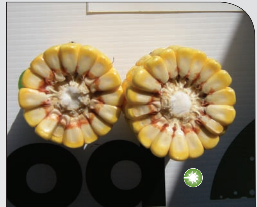
The corn on the right was treated with Carbon Boost-S and has 18 rows, on the left is the untreated control with 16 rows. Macomb, IL.